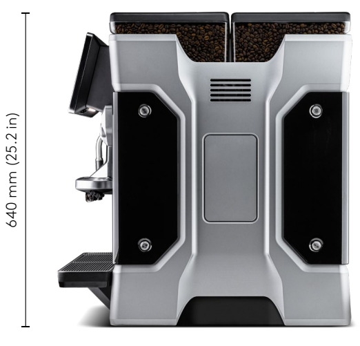
600 mm (23.6 in)